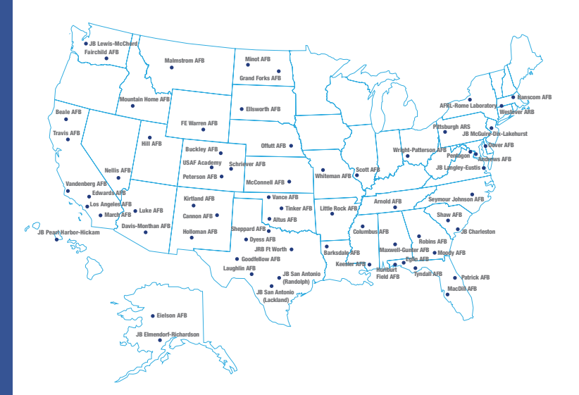
*Not all locations offer internships

For more info, contact the Contracting Career Field Team AFPC.COPPERCAPINTERNS@US.AF.MIL